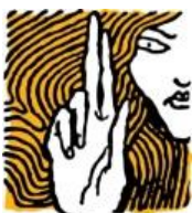
Hungarian Helsinki Committee

In the refugee camp you get a bed and 3 times food every day (or money to buy food for yourself, around 1000 Hungarian forints per day). You get pocket money , around 8000 Hungarian Forints (=25 EUR) every months. You have to get a humanitarian residence card ( hum.tart ) with your personal data. You can ask for the doctor if you have medical problems and you should get basic health care.